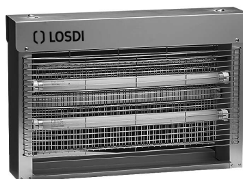
REF: CI-3X15-A STAINLESS STEEL Finish