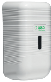
REF: CJ-3014-B Finish: WHITE