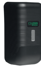
REF: CJ-3014-MT Finish: MATT BLACK