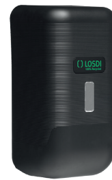
REF: CJ-3020-MT Finish: MATT BLACK