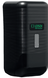
REF: CJ-3020-BL Finish: BLACK