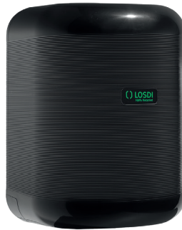
REF: CP-3010-BL Finnish: BLACK