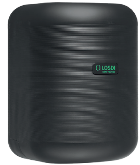
REF: CP-3010-MT Finnish: MATT BLACK