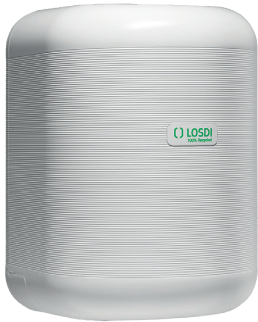
REF: CP-3010-B Finnish: WHITE