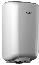
REF: CP-0528-B-E WHITE Finish