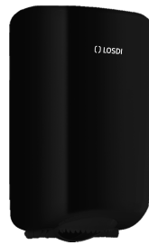
REF: CP-0528-C-BL-E BLACK Finish