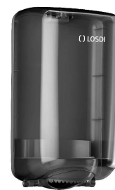
REF: CP-0528-E FUMÉ Finish