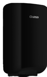
REF: CP-0528-C-BL BLACK Finish