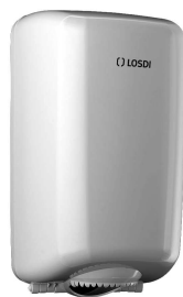
REF: CP-0528-B WHITE Finish