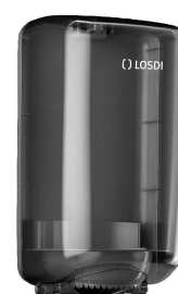
REF: CP-0528 FUMÉ Finish