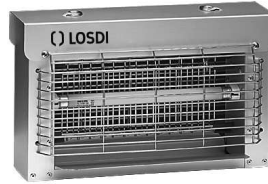
REF: CI-1X11-A STAINLESS STEEL Finish