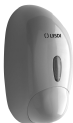
REF: CJ-1004-C Colour: WHITE