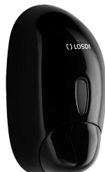
REF: CJ-1004-C-C-BL Colour: BLACK