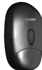
REF: CJ-1004-C-CG SILVER Finish