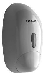
REF: CJ-1004 Colour: WHITE