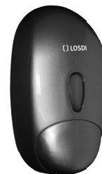
REF: CJ-1004-CG SILVER Finish