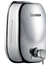
REF: CJ-1009-I BRIGHT Finish