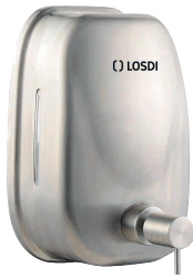
REF: CJ-1009-S SATIN Finish