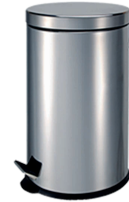
REF: MP-0603-S SATIN Finish