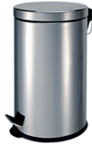
REF: MP-0603-I BRIGHT Finish