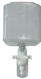
REF: CB-323 Colour: WHITE GEL