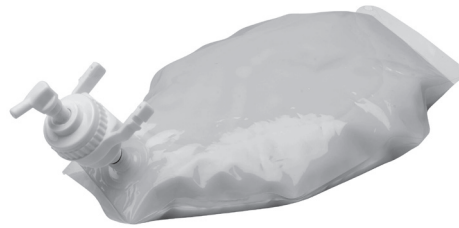
REF: CB-513 Colour WHITE LIQUID