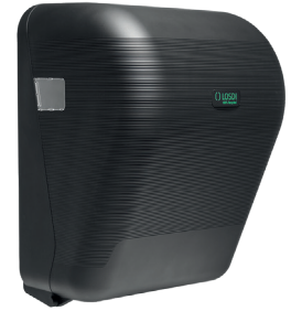
REF: CP-3525-MT Finish BLACK MATT