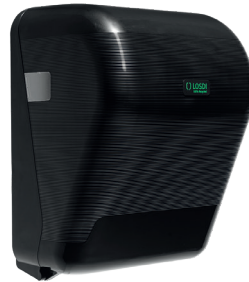
REF: CP-3525-BL Finish BLACK