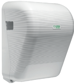
REF: CP-3525-B Finish WHITE