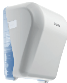
REF: CP-6525-B Colour WHITE