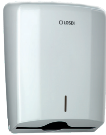
REF: CP-0106-B Finish WHITE