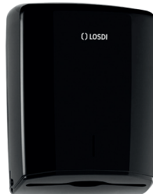
REF: CP-0106-C-BL Finish BLACK