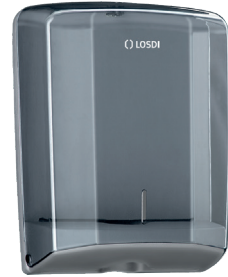
REF: CP-0106 Finish TRANSPARENT