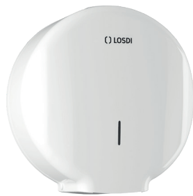
REF: CP-0205-B Finish WHITE