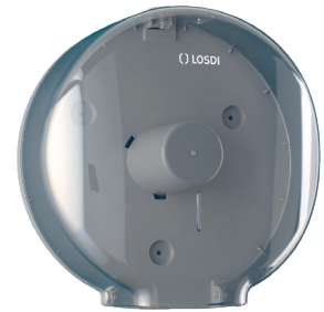
REF: CP-0205 Finish TRANSPARENT