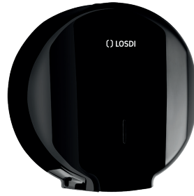
REF: CP-0205-C-BL Finish BLACK