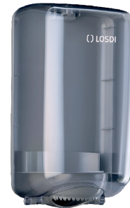
REF: CP-0528 TRANSPARENT Finish