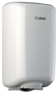
REF: CP-0528-B WHITE Finish