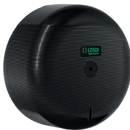
REF: CP-3000-BL Colour: BLACK