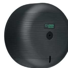
REF: CP-3000-MT Colour: BLACK MATT