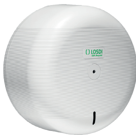
REF: CP-3000-B Colour: WHITE