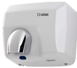
REF: CS-500-X WHITE LACQUERED METAL Finish