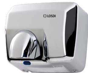
REF: CS-500-I/X BRIGHT STEEL Finish