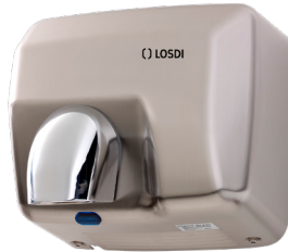
REF: CS-500-S/X SATIN STEEL Finish