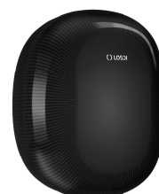
REF: CP-5010-BL Colour BLACK