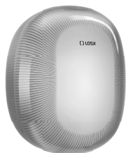
REF: CP-5010-B Colour WHITE