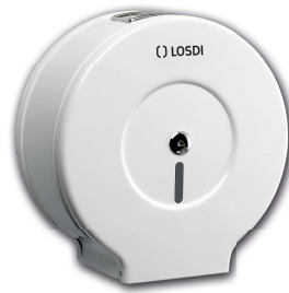
REF: CP-0203 WHITE EPOXY Finish