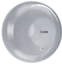
REF: CP-4000-B Colour WHITE