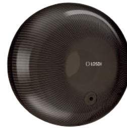
REF: CP-4000-BL Colour BLACK