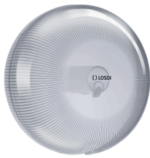
REF: CP-5007-B Colour: WHITE