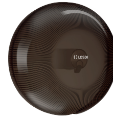
REF: CP-5007-BL Colour: BLACK