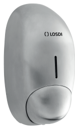
REF: CJ-1001-S SATIN Finish