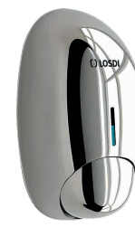
REF: CJ-1001-I BRIGHT Finish