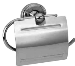
REF: CO-0210-I BRIGHT Finish