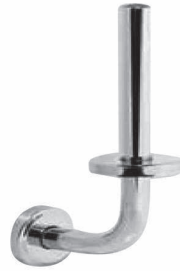
REF: CO-0211-I BRIGHT Finish