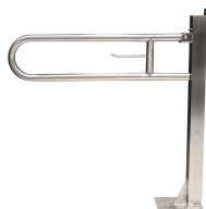
REF: MB-0103-S SATIN Finish