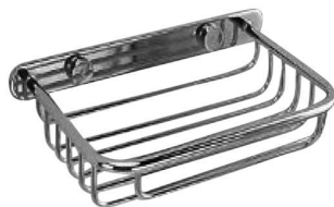
REF: CJ-2000-I CHROMED Finish