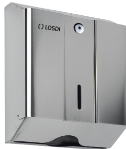
REF: CO-0104 SATIN Finish