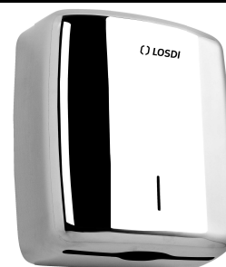
REF: CO-0107-I BRIGHT Finish