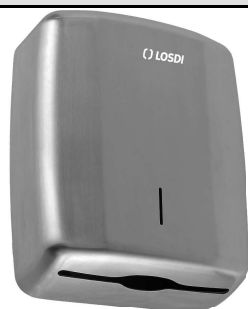
REF: CO-0107-S SATIN Finish