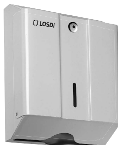
REF: CP-0105 WHITE EPOXY Finish