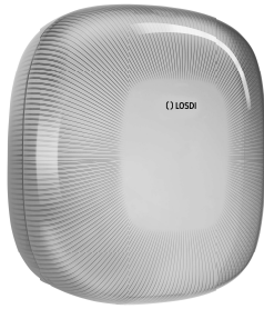
REF: CP-5009-B Colour WHITE