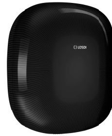
REF: CP-5009-BL Colour BLACK