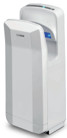
REF: CS-700-X WHITE Finish