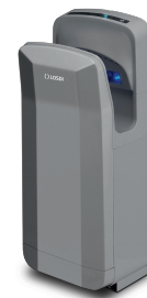
REF: CS-700-G/X SILVER Finish