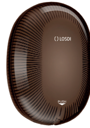
REF: CJ-5003-BL Colour: BLACK