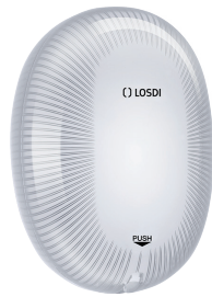
REF: CJ-5003-B Colour: WHITE